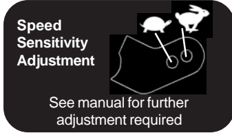
Figure: Decal on side of Control Console

The controls are initially set with the Speed/Sensitivity Adjustment in the slower, less sensitive position. After becoming completely familiar with mower operation the operator may desire to increase